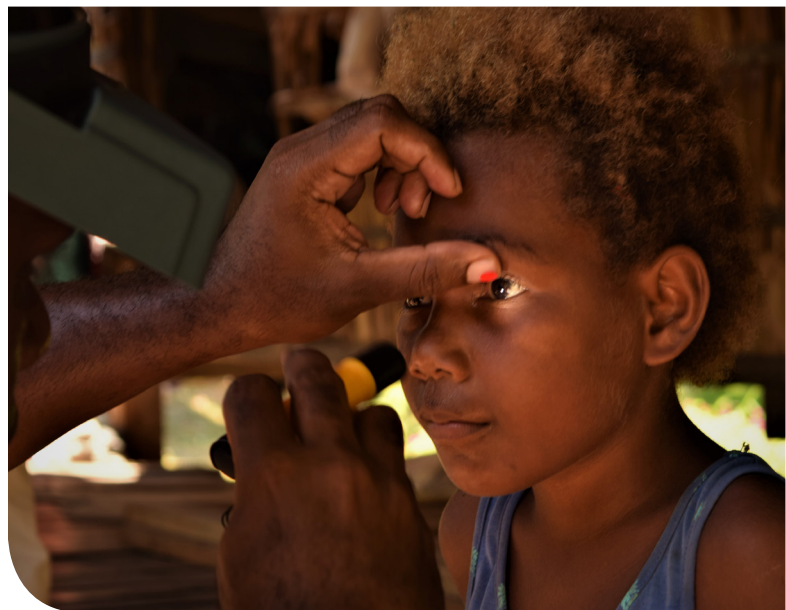
Children are examined for trachoma in the Solomon Islands

As a result of the research, the Government of Vanuatu was authorised to start compiling a dossier to claim validation of elimination of trachoma as a public health problem. Ongoing surveys are needed to validate the impact of elimination work in Kiribati and the Solomon Islands; and establish baseline prevalence of trachoma in suspected endemic areas of Fiji and Papua New Guinea. With its partners in the Pacific, The Foundation will continue to support efforts to better understand trachoma to ensure that treatment strategies are effective and all countries are equipped with high-quality evidence to support their efforts to eliminate this painful disease.